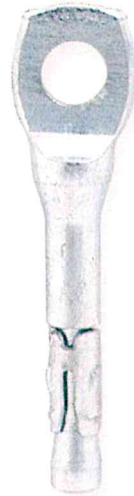
Figure 1 – 1/4-in. Diameter I-Pin Anchor

Figure 1 presents a photograph of the 1/4-in. diameter I-Pin anchor.