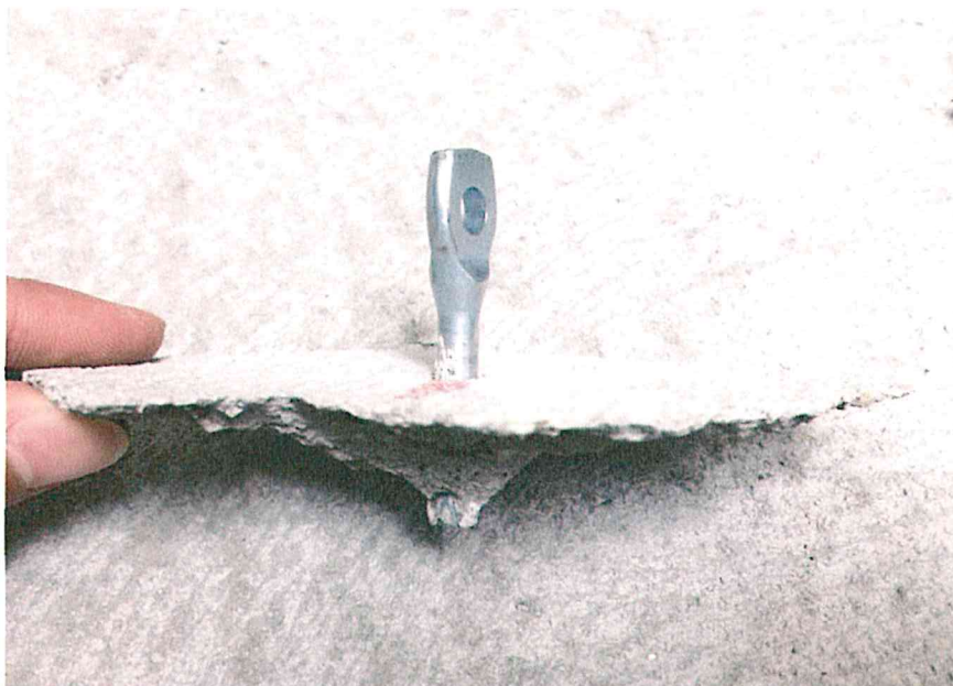
Figure 3 – Failure Mode – I-Pin Anchor Pullout and Concrete Breakout

Figure 3 presents a photograph of the noted failure mode. The failure mode of all tests is recorded in the attached laboratory data sheets.